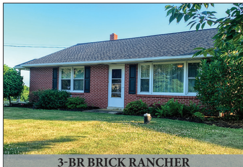
3-BR BRICK RANCHER

VERY NICE 3-BR BRICK RANCHER * NEW ROOF HALF ACRE * DETACHED 2-CAR GARAGE * OPEN FLOORPLAN TUESDAY, SEPTEMBER 21, 2021 @ 6:30 PM