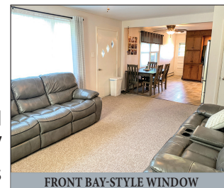
FRONT BAY-STYLE WINDOW

REAL ESTATE: A very nice Brick Rancher w/ good updates & detached garage on half acre level lot. House was built in 1960 and has 1,064 sq. ft. on the main level, includes an eat-in kitchen w/ Oak cabinetry, updated counter top & tile backsplash, updated stainless-steel kitchen appliances (very nice); open to living room w/ front Bay style window (kitchen & living room has 31' of open space); 3 bedrooms all w/ closet storage; full updated bathroom w/ tile walls; covered side entrance; full basement w/ laundry hookup; oil fired hot water baseboard heat; rear Bilco entrance/exit door; on-site well & septic; water softener & UV light; updated windows; new roof in 2019; whole-house fan; DETACHED 2-CAR GARAGE is 24'x 22'; 2 overhead doors; concrete floor; electric hookup; work area; brand new roof; newer 16'x 10' storage barn; desirable Penn Twp. & Manheim Central School District; total taxes only approx. $2,735. This is a very clean house with quality updates through-out. Nice country location beside farmland, ready for immediate occupancy; please come and take a look.