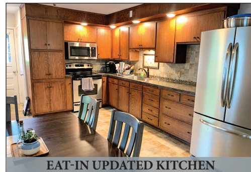
EAT-IN UPDATED KITCHEN

Located at 394 W. Newport Rd. Lititz Pa. 17543