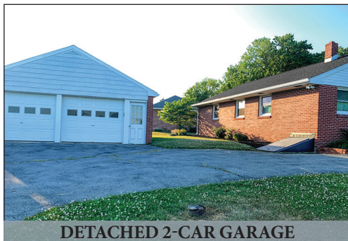
DETACHED 2-CAR GARAGE