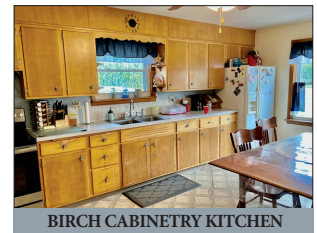
BIRCH CABINETRY KITCHEN

For photos & complete listing visit www.martinandrutt.com