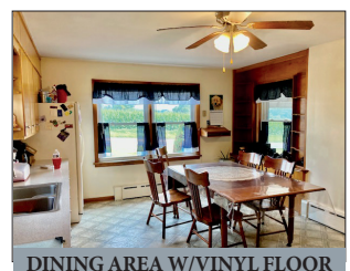
DINING AREA W/VINYL FLOOR