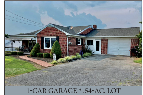
1-CAR GARAGE * .54-AC. LOT

Located at 1505 Main St. East Earl, Pa. East Earl Twp. Lancaster Co.