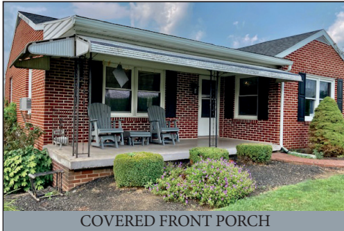
COVERED FRONT PORCH