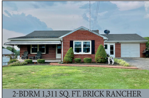
2-BDRM 1,311 SQ. FT. BRICK RANCHER