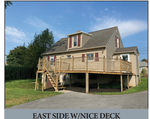
EAST SIDE W/NICE DECK

Located at 15 S. Soudersburg Rd. Ronks, Pa. E. Lampeter Twp. Lancaster Co.