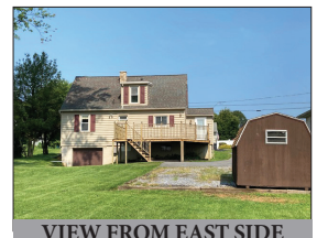
VIEW FROM EAST SIDE