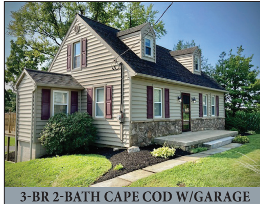
3-BR 2-BATH CAPE COD W/GARAGE