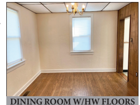
DINING ROOM W/HW FLOORS