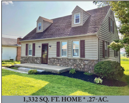
1,332 SQ. FT. HOME * .27-AC.

3-BDRM 2-BATH CAPE COD STYLE HOME w/1-CAR GARAGE * .27-AC. LOT 1,332 Sq. Ft. LIVING AREA * DAYLIGHT BASEMENT * NICE REAR DECK! THURS. SEPT. 16, 2021 @ 6:30 PM