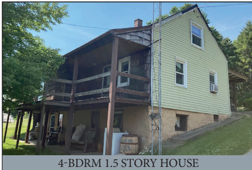
4-BDRM 1.5 STORY HOUSE

4-BR 1.5 STORY HOME * 2-STORY BARN * 3.7-ACRE FARMETTE! 100'x 20' GREENHOUSE * SEVERAL SMALL BARN * PASTURE VEHICLES * AC TRACTOR * TOOLS * ANTIQUES * PERSONAL PROP. SAT. SEPT. 11, 2021 @ 9-AM/Real Estate @ 1-PM