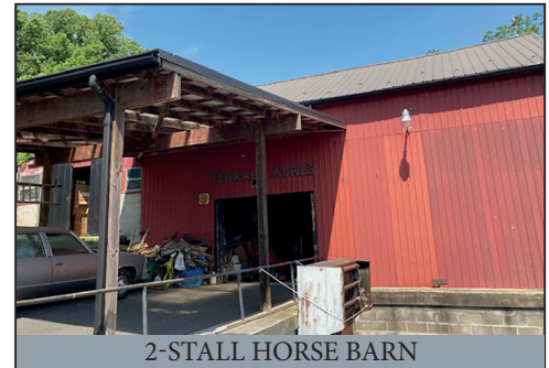
2-STALL HORSE BARN

Located at 187 Tabor Rd. New Holland, Pa. Earl Twp. Lancaster Co.