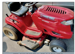
TROY BILT 7-SP MOWER