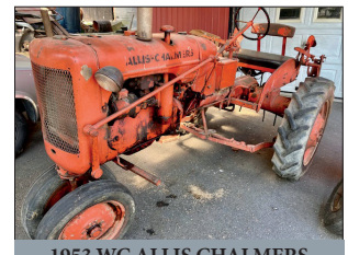
1953 WC ALLIS CHALMERS