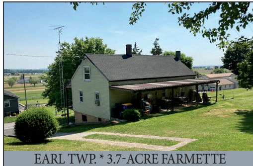
EARL TWP. * 3.7-ACRE FARMETTE