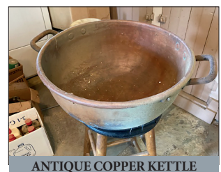
ANTIQUE COPPER KETTLE