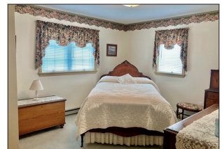
1-OF-3 LARGE BEDROOMS