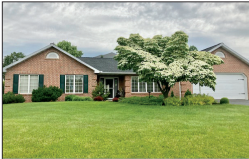
3-BDRM 2-BATH RANCHER