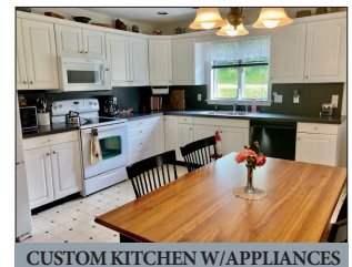
CUSTOM KITCHEN W/APPLIANCES

BROKER PARTICIPATION INVITED * CONTACT AUCTIONEER FOR DETAILS For photos & complete listing visit www.martinandrutt.com