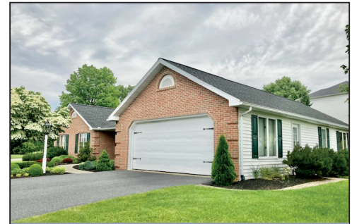
2-CAR GARAGE * .43-AC. LOT

Located at 69 N. Whisper Ln. New Holland, Pa. 17557 (The Willows neighborhood)