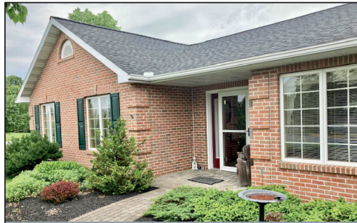
CUSTOM 1,976 SQ. FT. DWELLING