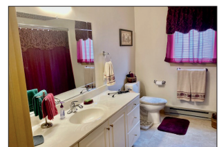
1-OF-2 FULL BATHROOMS