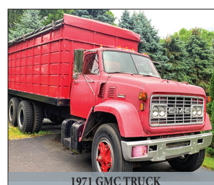
1971 GMC TRUCK

PERSONAL PROPERTY: Nice Black 1949 Ford pickup truck w/ flathead V-8; 1971 GMC tandem axle truck w/ 18' grain body, rebuilt Cat diesel engine & Road Ranger transmission; nice 2012 Silver Grand Caravan van w/ 149k; 100 gal. vertical 3-hp air compressor; John Deere Model 102 17-hp mower (deck as-is); Snapper roto-tiller; Troy-Bilt horse roto-tiller (as-is); 225 Lincoln welder; battery charger; nice "truck size" mechanical tools; ¾" air impact driver; old truck parts; Toro 7.25-hp self-propelled mower; S/S 5th wheel tailgate; chrome bumper for Kenworth W-9; JET wood lathe; propane heaters & tanks; bench grinder; older Stihl chainsaw; hand tools; 5 car barrel train; wood router; old barn boards; (4) 6" air tires; Stihl leaf blower; weed trimmer; Redi-heater; hand tools; step ladder; much more unlisted.