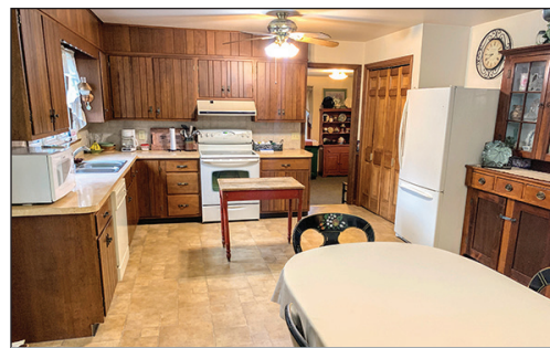
HUGE KITCHEN/DINING AREA

Located at 1284 Sheep Hill Rd. East Earl Pa. 17519 (East Earl Twp.)