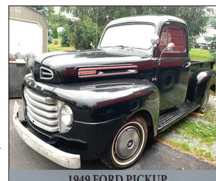
1949 FORD PICKUP

REAL ESTATE: A charming Cape Cod style house w/ approx. 2,174 sq. ft. & 30'x 26' detached truck shop on .7 acre lot. This house was built in 1971; main level includes a 22' x 14.5' eat-in kitchen w/ custom Cherry cabinetry, tile backsplash, sink window overlooking the backyard; front 18.5'x 14' living room w/ hardwood flooring & built-in cabinetry; formal family room; 2 main level bedrooms w/ closets (1 could be a hobby/office room); full bathroom; beautiful 18' x 12' rear all-seasons room w/ abundant windows & cathedral ceiling; mud room/laundry w/ closet and rear door access; nice concrete back patio. Second level has 2 additional bedrooms w/ closets; full bathroom; storage room or finish it for additional living space. Basement has been studded out, but is unfinished; brick hearth w/ propane room heater; utility room; rear Bilco door; electric heat pump & central A/C (new in 2019); public sewer; good private well; water softener; central vac.; 200 amp elec. service. 30' x 26' TRUCK SHOP w/ 12' high x 16' wide overhead door; 13' ceiling; insulated; heat; 220v elec.; parts room; updated rubber roof; large macadam drive for trucks; 28' x 12' storage building w/ overhead door & elec.; E. Lanc. School District; total taxes approx. $3,945.