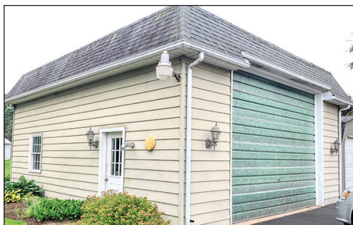
30'X26'X13' TRUCK SHOP