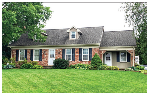
4-BR CAPE COD STYLE

BEAUTIFUL 4-BR CAPE COD HOUSE & REAR SUNROOM .7 ACRE LOT * 30'x 26' TRUCK GARAGE * VERY NICE PROPERTY ANTIQUES * HOUSEHOLD ITEMS * COLLECTIBLE VEHICLES SATURDAY, AUGUST 28, 2021 @ 8:30 AM * R.E. @ 1:00 PM