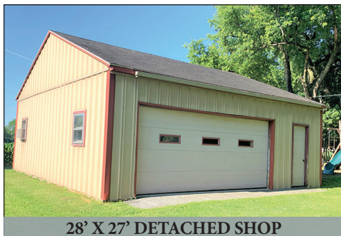
28' X 27' DETACHED SHOP