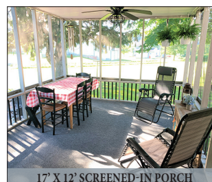
17' X 12' SCREENED-IN PORCH

the back yard; open to front living room w/ front Bay style window; 2 bedrooms w/ closets (one could be office or hobby room); full bathroom; beautiful 17'x 12' rear screened-in porch; 1 car attached garage; front walkway. Second level has full rear dormer; 2 additional bedrooms w/ closets (1-Cedar); half bathroom; balcony above porch. Lower level has large finished family room; laundry area; utility room w/ canning shelving. Oil fired warm air heat; central A/C on main level & basement; 200 amp elec. service; on-site well & septic; DETACHED GARAGE/SHOP is 28' x 27'; steel exterior; insulated; water hookup; furnace; concrete floor; 16'X 7' overhead door; backyard backs-up to farmland; zoned residential; Clay Twp.; Ephrata Area School District; total taxes approx. $3,360. A nice clean house ready to move right in, please come and take a look.