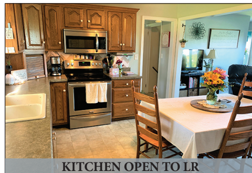
KITCHEN OPEN TO LR

Located at 190 Icehouse Hill Rd. Ephrata Pa. 17522