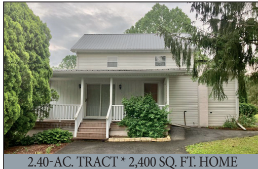
2.40-AC. TRACT * 2,400 SQ. FT. HOME