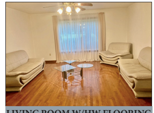
LIVING ROOM W/HW FLOORING