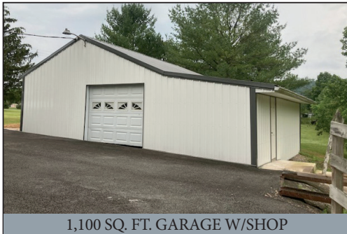
1,100 SQ. FT. GARAGE W/SHOP