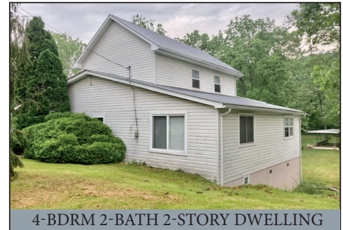
4-BDRM 2-BATH 2-STORY DWELLING

Located at 12344 Big Valley Pike, Mill Creek, Pa. Brady Twp. Huntingdon Co.