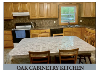
OAK CABINETRY KITCHEN

For photos & complete listing visit www.martinandrutt.com