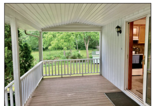
CHARMING FRONT PORCH