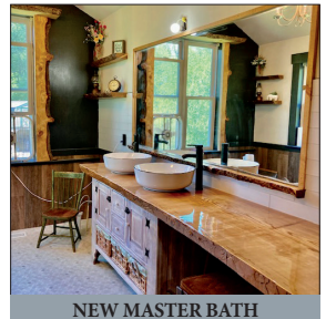
NEW MASTER BATH