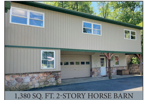
1,380 SQ. FT. 2-STORY HORSE BARN

Located at 613 Springville Rd. New Holland, Pa. Salisbury Twp. Lancaster Co.