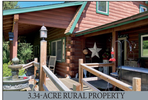
3.34-ACRE RURAL PROPERTY