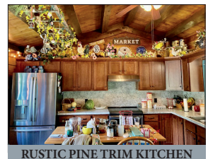
RUSTIC PINE TRIM KITCHEN