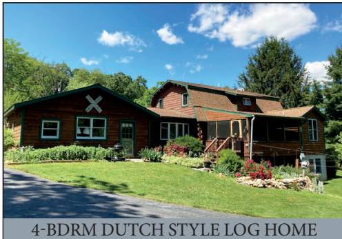
4-BDRM DUTCH STYLE LOG HOME