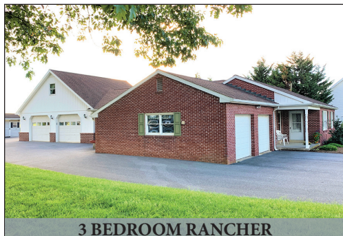
3 BEDROOM RANCHER