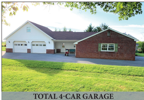
TOTAL 4-CAR GARAGE