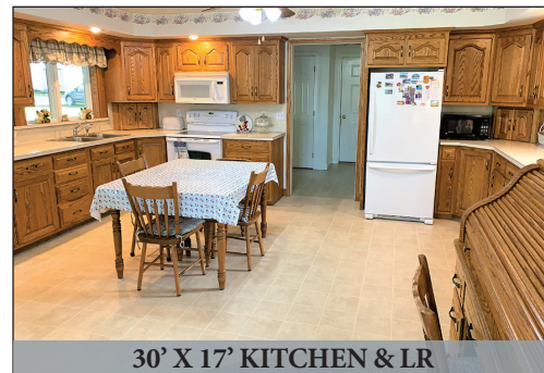
30' X 17' KITCHEN & LR

Located at 45 N. Farmersville Rd. Ephrata Pa. 17522