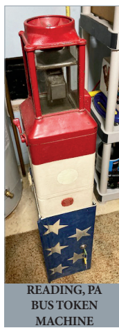
READING, PA BUS TOKEN MACHINE

CAR: 1994 Buick LaSabre sedan, 70k mi, blue, leather, loaded, V-6, serviced & inspected, runs great!