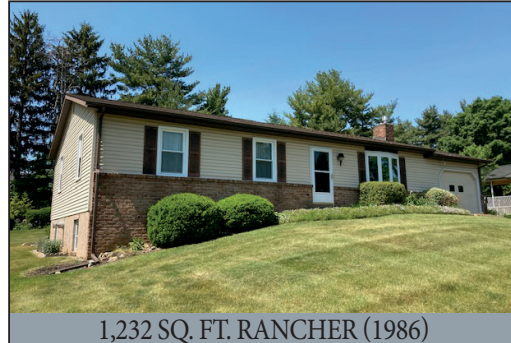
1,232 SQ. FT. RANCHER (1986)