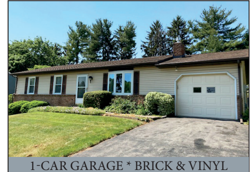
1-CAR GARAGE * BRICK & VINYL

Located at 624 Enfield Dr. Lancaster, Pa. E. Lampeter Twp. Lancaster Co.