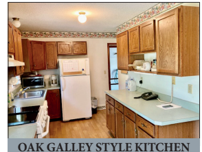
OAK GALLEY STYLE KITCHEN

TERMS: Cash, PA check or credit card w/3% fee, Fisher's food stand, sale held under tent bring a chair.