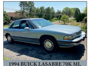
1994 BUICK LASABRE 70K MI.