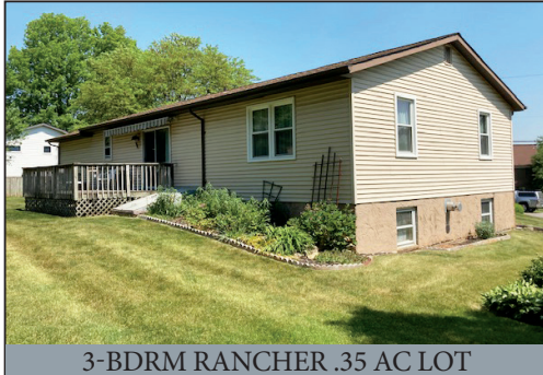
3-BDRM RANCHER .35 AC LOT

3-BDRM 2-BATH RANCHER w/1-CAR GARAGE * .35-AC. LOT OAK CABINETRY KITCHEN * CENTRAL AC/GAS HEAT * FINISHED LOWER LEVEL 1994 BUICK LaSABRE 70k mi. * TOOLS * ANTIQUES * PERSONAL PROPERTY SAT. JULY 17, 2021 @ 8:30 AM/Real Estate @ 1-PM