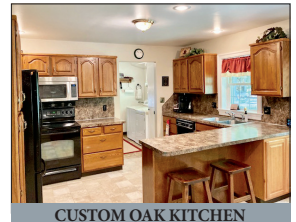
CUSTOM OAK KITCHEN