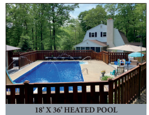
18' X 36' HEATED POOL

REAL ESTATE: consists of a 2,128 sq. ft. 3-bdrm Dutch style 2-story home (1988) w/attached 2-car garage on a 2.2-acre lot. Main floor features a beautiful custom oak cabinetry kitchen w/sit-up bar, appliances included, open to dining room w/access to rear deck, brick FP, vinyl flooring; a foyer w/open staircase & HW floors; 16'x14' formal living room w/access to enclosed 16'x16' screened porch; 14'x14' office/bedroom; ½ bath; laundry; attached 2-car garage; upper level includes 3-bedrooms w/closets & full bath; master BR suite has private full bath; basement is finished w/large family room, 4th guest bedroom; outside entrance, egress window; utility storage room; water treatment system; on-site well & septic; outdoor wood furnace serves home w/efficient HW heat; vinyl siding, good asphalt shingle roof, insulated windows & doors; 2021 taxes: $4,502. Outbuildings: include 2-utility barns/sheds; 2-firewood shelters & firewood included; a beautiful 18'x36' heated in-ground pool & hot tub area; pool house w/privacy fencing. Peaceful wooded setting w/ newly paved driveway & parking area.