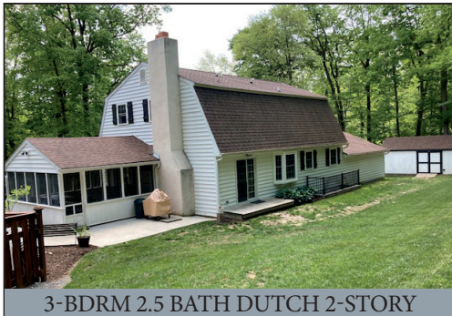
3-BDRM 2.5 BATH DUTCH 2-STORY