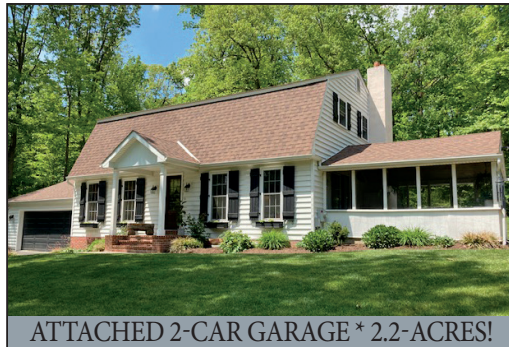
ATTACHED 2-CAR GARAGE * 2.2-ACRES!