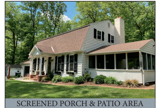
SCREENED PORCH & PATIO AREA

Located at 2337 Laurel Top Circle, Narvon, Pa. Caernarvon Twp. Lancaster Co.