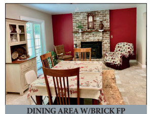
DINING AREA W/BRICK FP