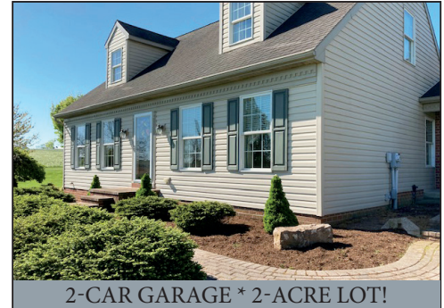
2-CAR GARAGE * 2-ACRE LOT!

Located at 1864 N. Churchtown Rd. East Earl, Pa. Caernarvon Twp. Lancaster Co.