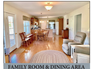
FAMILY ROOM & DINING AREA