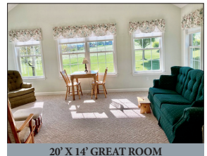
20' X 14' GREAT ROOM