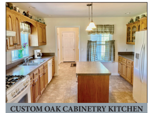
CUSTOM OAK CABINETRY KITCHEN

For photos & listing visit www.martinandrutt.com