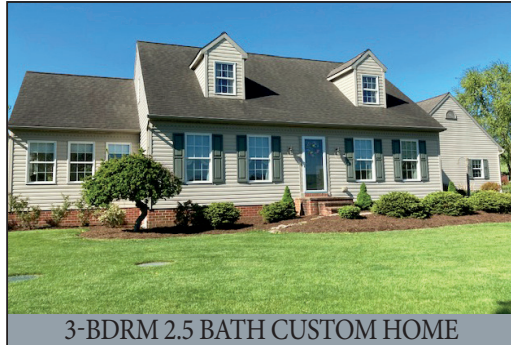
3-BDRM 2.5 BATH CUSTOM HOME