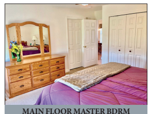
MAIN FLOOR MASTER BDRM