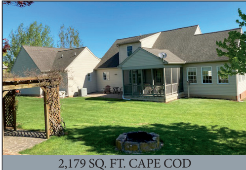
2,179 SQ. FT. CAPE COD