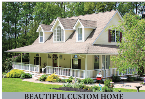
BEAUTIFUL CUSTOM HOME

WEDNESDAY JUNE 30, 2021 @ 5-PM * R.E. @ 6-PM