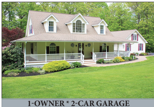
1-OWNER * 2-CAR GARAGE