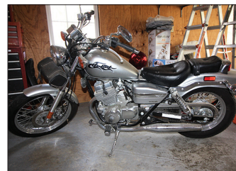
2008 HONDA REBEL

BRIEF TERMS: 10% down payment day of auction, balance in 60 days or before. Attorney Kling & Deibler 717-354-7700. Auction held under the Attorney's terms.