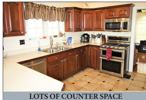
LOTS OF COUNTER SPACE

Located at 475 Ginger Pat Dr., Narvon PA 17555