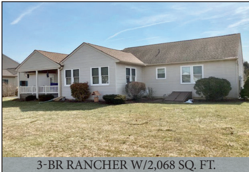
3-BR RANCHER W/2,068 SQ. FT.

3-BDRM 2-BATH RANCHER w/2-CAR GARAGE * .32-AC. LOT NEW CUSTOM CHERRY KITCHEN * 4-SEASONS ROOM * UTILITY SHED LAWN, GARDEN & POWER TOOLS * SNAPPER LAWN TRACTOR (1-YR) * GUNS COINS * FURNITURE * NH MACHINE MEMORABILIA * PERSONAL PROPERTY SATURDAY, MAY 8, 2021 @ 9-AM/Real Estate @ NOON