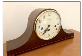
HAMILTON MANTLE CLOCK

TERMS: Cash, PA check or credit card w/3% fee. Food by GSFR aux.; sale held under tent bring a chair. All sale day announcements take precedence over any prior ads.