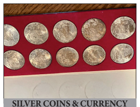
SILVER COINS & CURRENCY