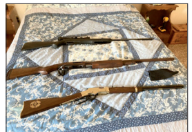
QUILTS & GUNS