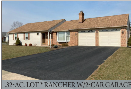
.32-AC. LOT * RANCHER W/2-CAR GARAGE