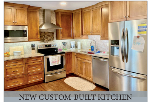
NEW CUSTOM-BUILT KITCHEN

Located at 235 Hawthorn St. New Holland, Pa. 17557