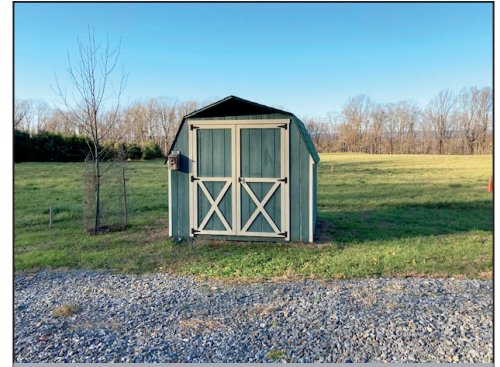
OPEN 10-ACRE PROPERTY

Located at 136 Grist Mill Rd. Schuylkill Haven, Pa. Washington Twp. Schuylkill Co.