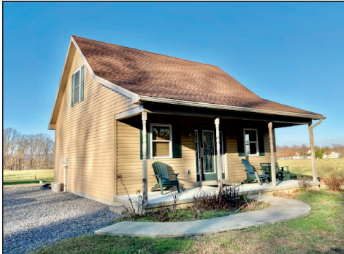
1,014 SQ. FT. CAPE COD STYLE COTTAGE