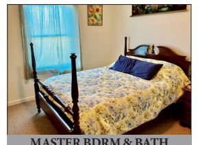
MASTER BDRM & BATH