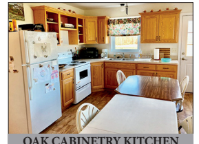
OAK CABINETRY KITCHEN

OPEN HOUSE: SAT. MAY 1 & 8 from 1-3 PM for info call/text auctioneer @ (717) 371-3333.