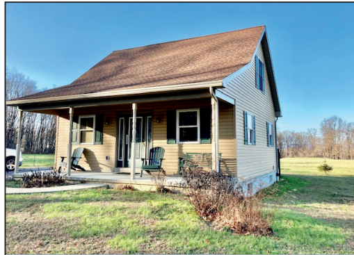
3-BR, 2-BA CABIN (NEW 2013)