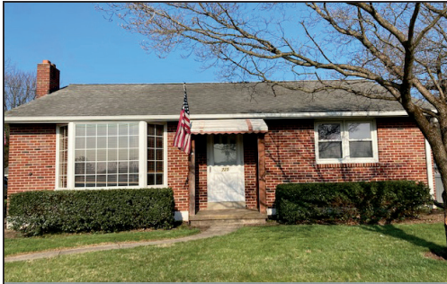
2-BR BRICK RANCHER (1954)