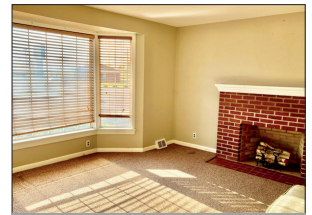
17'X13' LIVING ROOM

For photos & listing visit www.martinandrutt.com