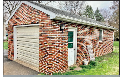
420 SQ. FT. GARAGE