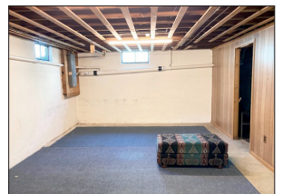
PARTIALLY IMPROVED BASEMENT