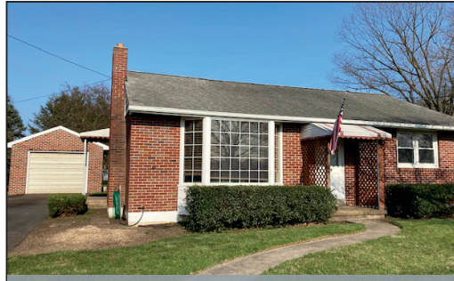
1,102 SQ. FT. RANCHER