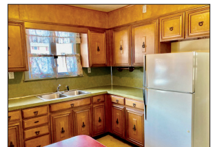
BIRCH CABINETRY KITCHEN