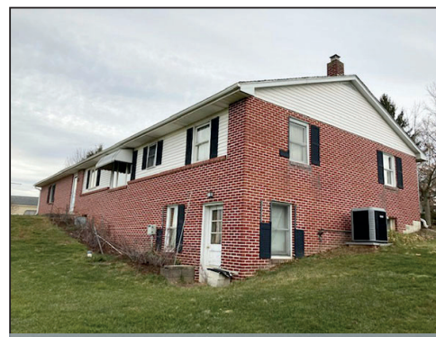
DAYLIGHT BASEMENT * .47-AC.

Located at 265 Stone Quarry Rd. Leola, Pa., W. Earl Twp., Lancaster Co.