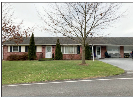
2-BDRM RANCHER W/GARAGE