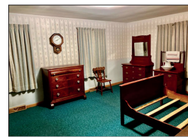
1-OF-2 LARGE BEDROOMS