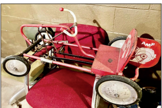
AMF PEDAL CAR