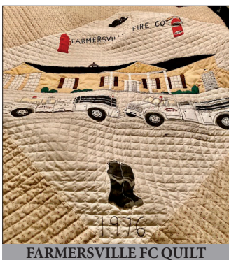
FARMERSVILLE FC QUILT