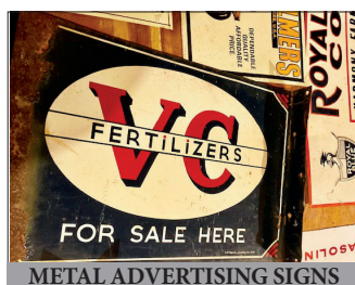
METAL ADVERTISING SIGNS

PERSONAL PROPERTY: MTD 26" snow blower; 2800 PSI pressure washer; air compressor; many power drills & saws; axes, sledge, bench grinder; kero stove; metal & wood folding rules; battery charger; lawn, garden & garage items; lumber, plus much more not listed.