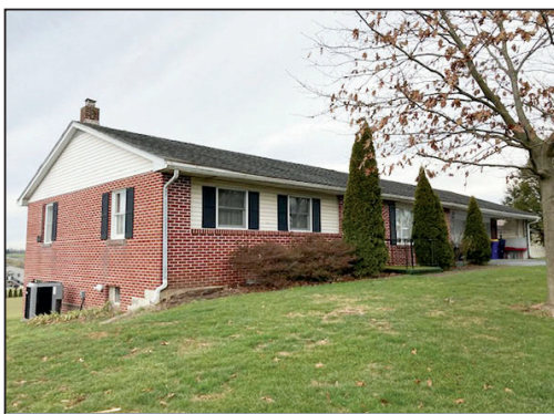
1,560 SQ. FT. BRICK RANCHER

2-BDRM BRICK RANCHER w/2-CAR GARAGE * .47-AC. LOT BEAUTIFUL RAISED PANEL CUSTOM KITCHEN * DAYLIGHT BASEMENT ANTIQUES * FARM TOYS & METAL SIGNS * FURNITURE * TOOLS SATURDAY, APRIL 10, 2021 @ 9-AM/Real Estate @ 1-PM