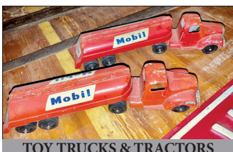
TOY TRUCKS & TRACTORS