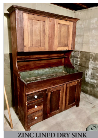
ZINC LINED DRY SINK