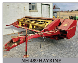
NH 489 HAYBINE