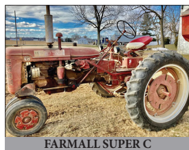
FARMALL SUPER C