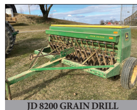
JD 8200 GRAIN DRILL