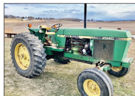
JD 2940 TRACTOR

Located at Located at 1105 E. Newport Rd. Lititz, Pa