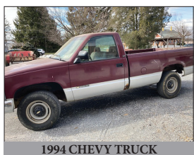
1994 CHEVY TRUCK