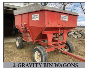
2-GRAVITY BIN WAGONS