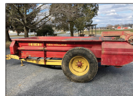
NH 514 SPREADER

TERMS: CASH, PA CHECK or CREDIT CARD w/3% FEE. Benefit Food Stand; all sale day announcements take precedence over any prior ads; Auction Co. & seller not responsible for accidents.