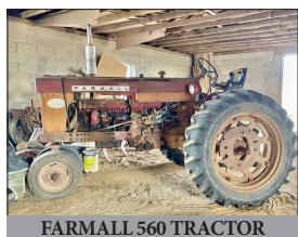
FARMALL 560 TRACTOR