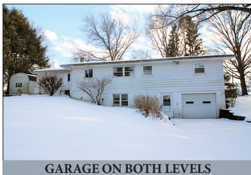
GARAGE ON BOTH LEVELS