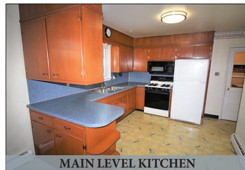
MAIN LEVEL KITCHEN

Located at 134 Scenic View Dr. (3rd St.) Ephrata Pa. 17522