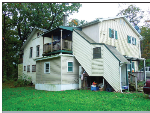
3,110 SQ. FT. FRAME DWELLING