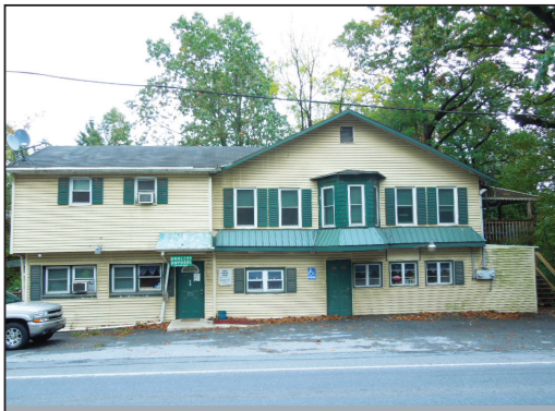
4-UNIT APARTMENT * 3.8-AC.