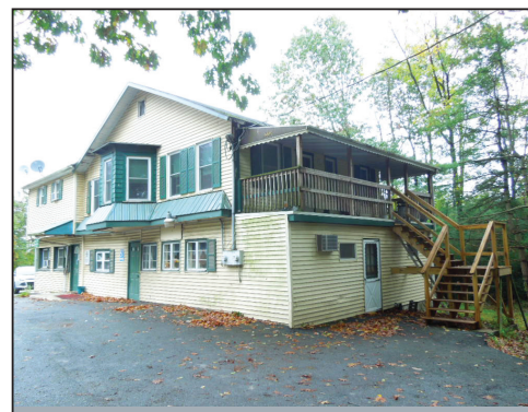
2-STORY APARTMENT BLDG.

Located at 513 Twin Co. Rd. (Rt. 10) Honey Brook, Pa. Caernarvon Twp. Lancaster Co.