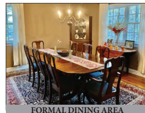
FORMAL DINING AREA