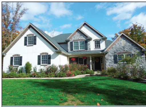
4-BDRM, 3.5 BATH HOME * 2.21-ACRES