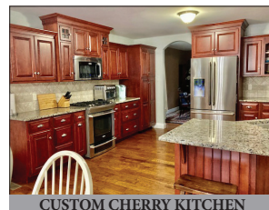
CUSTOM CHERRY KITCHEN