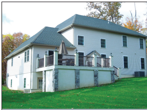
2-CAR GARAGE & PRIVATE REAR DECK