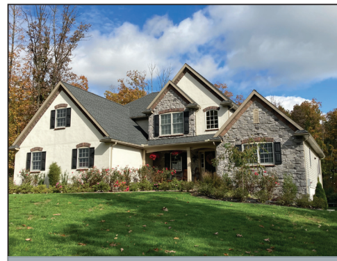
2,700+ SQ. FT. CUSTOM COLONIAL HOME

Located at 511 Meeting House Rd. Gap, Pa. Salisbury Twp. Lancaster Co.