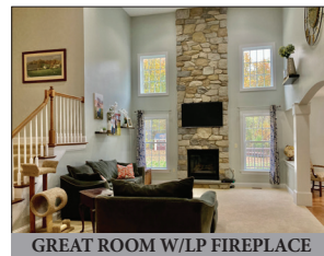
GREAT ROOM W/LP FIREPLACE