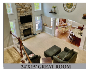
24'X15' GREAT ROOM

REAL ESTATE: consists of a spectacular 4-bdrm (new 2013) custom Colonial style 2,700+ sq. ft. stone/vinyl/stucco 2-story home situated on a rural 2.21-acre rural lot. Main floor features a covered front porch; foyer w/HW floor; 24'x15' great room w/LP stone FP, soaring 16' vaulted ceiling; open staircase; 15'x11' breakfast area w/slider door to 19'x14' rear composite deck; stunning custom cherry cabinet kitchen w/bar, granite counter tops, LP range, SS appliances; 13'x15' formal dining rm w/HW flooring; mud room/laundry; powder rm; master bdrm suite w/WIC & private bath w/walk-in shower & double granite-top vanity; oversized 24'x24' 2-car garage w/9' doors, built-in cabinetry & shop area; upper level includes 3-bdrms w/large WIC's; full bath; attic storage; daylight basement features 9' ceilings; a 1,525 sq. ft. family room/rec room; full bath; 200 sq. ft. utility rm w/13 SEER LP heat pump/central AC; LP water heater; water treatment system; Superior walls; 200 amp svc.; 500 gallon LP tank; on-site well & septic; wide macadam drive & parking area; custom-built 14'x20' utility barn; play-set; large level yard borders woodland!