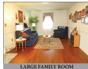
LARGE FAMILY ROOM