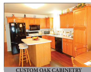
CUSTOM OAK CABINETRY

For photos & listing visit www.martinandrutt.com