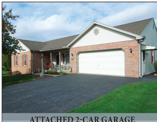
ATTACHED 2-CAR GARAGE