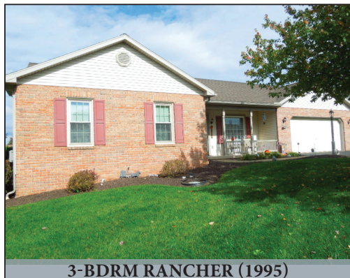
3-BDRM RANCHER (1995)