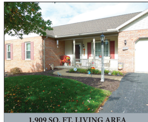
1,909 SQ. FT. LIVING AREA

Located at 560 Greenview Dr. Denver, Pa. Brecknock Twp. Lancaster Co.