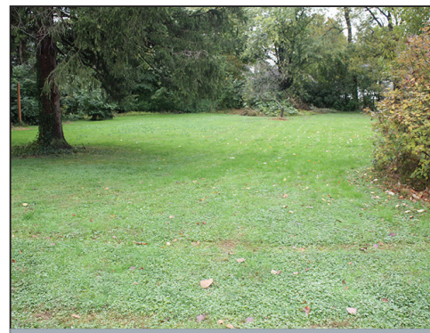
ZONED R-3 HIGH DENSITY

Located at 2760 Lititz Pike, Lancaster Pa. 17601