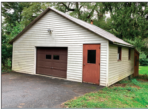
25'X 21' DETACHED GARAGE