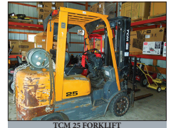
TCM 25 FORKLIFT

For photos & complete listing visit www.martinandrutt.com for info call Mike @ (717) 371-3333.