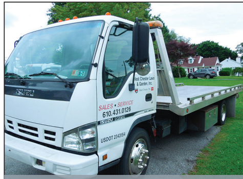
2007 ISUZU NRR ROLL-BACK TRUCK