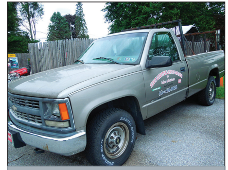
2000 CHEVY 2500 PICK-UP TRUCK

Located at 1301 Park Ave. W. Chester, Pa.