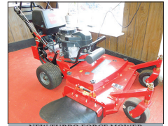
NEW TURBO FORCE MOWER