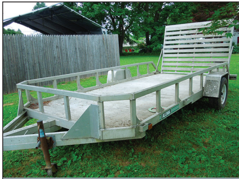
ALUMA 14' X 6.5' TRAILER