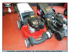
NEW MOWERS & SNOWBLOWERS