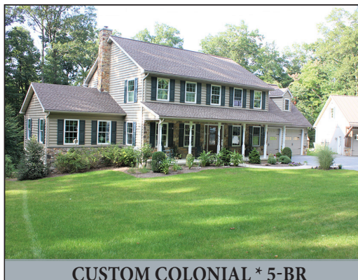
CUSTOM COLONIAL * 5-BR