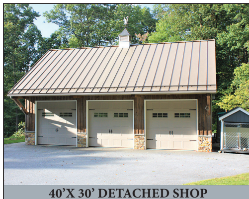
40'X 30' DETACHED SHOP