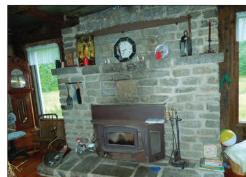
STONE FP IN 18'X32' GREAT ROOM