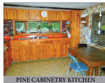
PINE CABINETRY KITCHEN

REAL ESTATE: consists of a (1968) 3-bdrm, 2-bath one-story residence; a new 2-stall 2-story horse barn & storage sheds situated on 7.23 acres. Main floor of original dwelling includes a mud room/covered porch; eat-in style kitchen w/pine cabinetry & wood stove; 10'x12' family room; 2-bedrooms & bath; newer addition includes an 18'x32' rustic great room w/exposed beam ceiling, pine wood flooring & large stone fireplace w/wood-burning insert; master bdrm w/private balcony & full bath; 18'x12' covered rear deck. Lower level daylight basement includes a 32'x18' storage/canning area; utility room w/water heater; 100-amp svc, currently disconnected, could easily be connected; on-site well & septic. Annual taxes approx.: $1,200. Outbuildings: include a new 32'x40' 2-stall Amish horse barn w/carriage bay & upper level hay storage; 2-frame storage sheds.