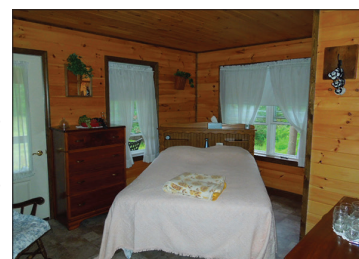
MASTER BEDROOM & BATH