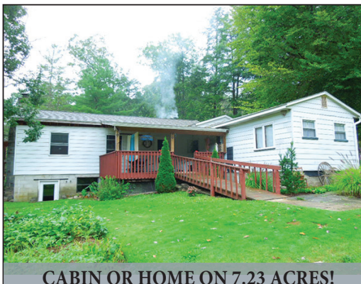
CABIN OR HOME ON 7.23 ACRES!