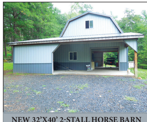
NEW 32'X40' 2-STALL HORSE BARN

Located at 10881 Reitz Ln. Mill Creek, Pa. 17060 Brady Twp. Huntingdon Co.