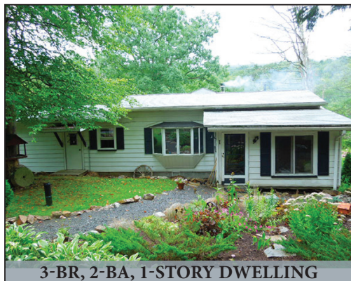
3-BR, 2-BA, 1-STORY DWELLING

3-BDRM, 2-BATH CABIN/HOME * NEW 2-STALL HORSE BARN 7.23 AC. TRACT * PASTURE/FOOD PLOT AREA, BALANCE WOODED! PRIVATE HUNTING/VACATION CABIN or YEAR ROUND DWELLING! FRIDAY, OCTOBER 9, 2020 @ 6-PM