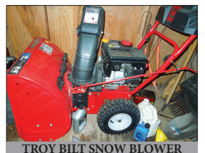
TROY BILT SNOW BLOWER