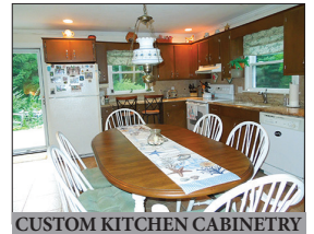
CUSTOM KITCHEN CABINETRY

Personal Property @ 5:30 PM: Troy Bilt snow blower; bolt bin organizer; office desk; 2-dressers; night stand; brass headboard; wooden rocker; cedar chest; maple cradle; storage cabinet; stool; Schwinn exercise bike & treadmill; etc. Not many small items-please be prompt!