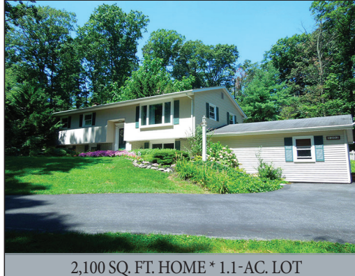
2,100 SQ. FT. HOME * 1.1-AC. LOT