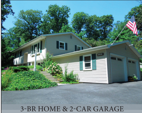
3-BR HOME & 2-CAR GARAGE

MONDAY, OCTOBER 5, 2020 @ 5:30 / Real Estate @ 6-PM