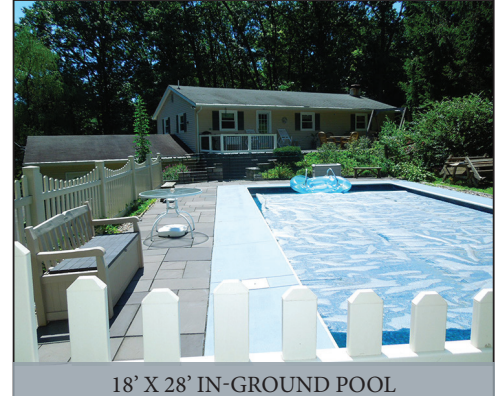
18' X 28' IN-GROUND POOL

Located at 1303 Reservoir Rd. New Holland, Pa. East Earl Twp. Elanco Schools