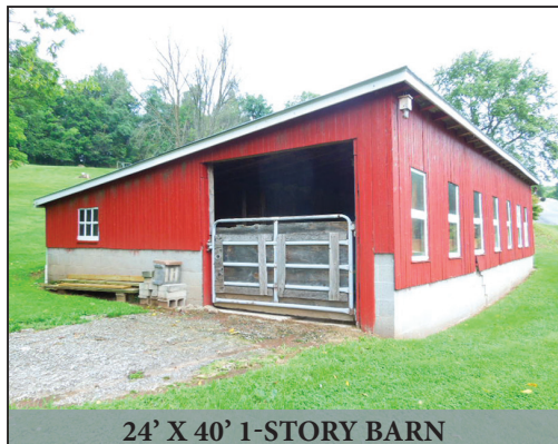
24' X 40' 1-STORY BARN