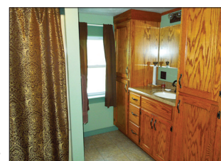
CUSTOM OAK BATHROOM