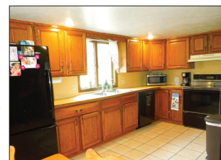
OAK CABINETRY KITCHEN

REAL ESTATE: consists of 3.1-acre tract w/a 3-bdrm 2-story home, a 3-bay garage, 24'x40' poultry barn plus wooded & pasture land. Main floor of home features a 22'x14' oak cabinetry eat-in style kitchen w/ pantry, range & DW; dining area w/country wainscoting & built-in antique dry-sink; 14'x20' living room; of-ice area w/built-in cabinetry/bookshelves; 12'x12' den or 1st floor bedroom; laundry room; covered front porch & side deck/patio; upper level includes 3-updated bedrooms & full bath w/custom oak cabinetry & Corian vanity top; walk-out basement is unimproved; utility room w/wood/coal forced air furnace aux. heat; electric heat throughout; on-site well & septic; annual taxes: $4,850. Outbuildings: a 24'x40' 3-bay concrete block garage/shop w/wide macadam driveway & parking area; a one-story 24'x40' poultry/animal barn w/stalls; 2-goat shelters on 1-acre fenced pasture; large additional pasture/lawn area w/strong spring.