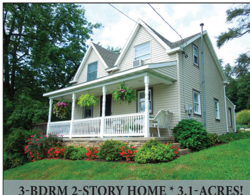
3-BDRM 2-STORY HOME * 3.1-ACRES!