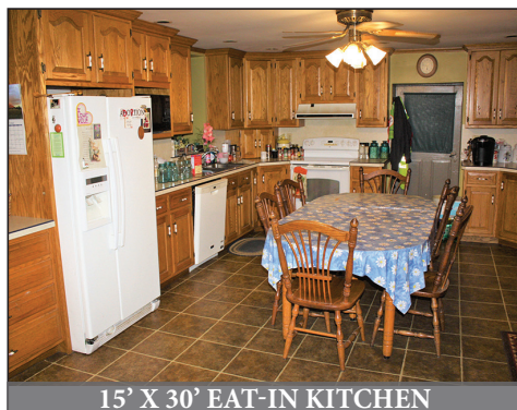
15' X 30' EAT-IN KITCHEN