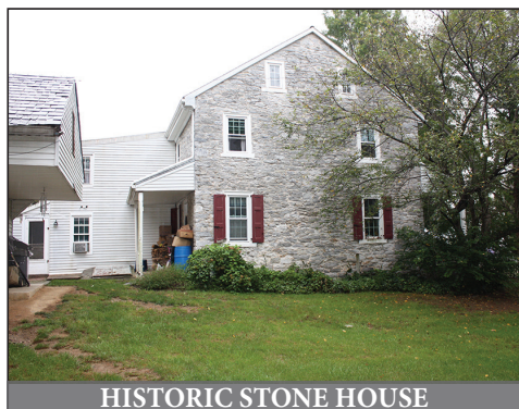
HISTORIC STONE HOUSE

1.56 ACRE COUNTRY LOT * 5 BEDROOMS * CLEAN HISTORIC LIMESTONE HOUSE * ANIMAL BARN & PASTURE GUNS * TOOLS * MOWERS * HOUSEHOLD ITEMS SATURDAY, OCTOBER 24, 2020 @ 9:00 AM * R.E. @ 12:00 PM