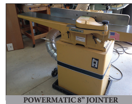
POWERMATIC 8" JOINTER