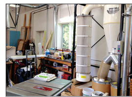
ONEIDA DUST COLLECTOR