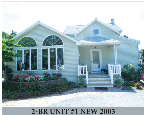
2-BR UNIT #1 NEW 2003

FRIDAY, OCTOBER 23, 2020 @ 4-PM/Real Estate @ 5-PM