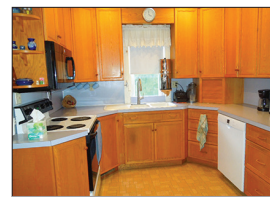
UNIT 2 OAK KITCHEN