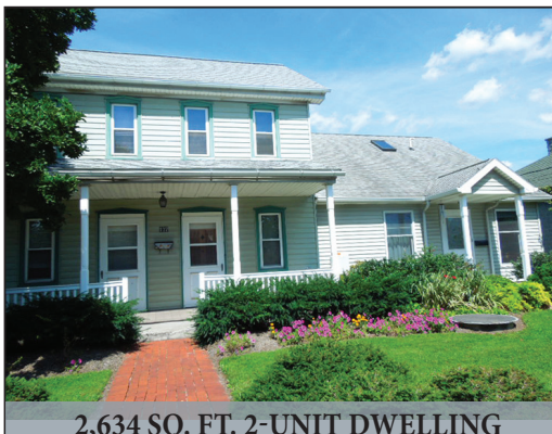
2,634 SQ. FT. 2-UNIT DWELLING