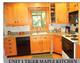
UNIT 1 TIGER MAPLE KITCHEN