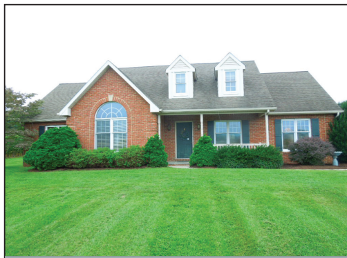
3-BDRM CUSTOM BRICK & VINYL HOME

3-BDRM CUSTOM BUILT HOME w/2 CAR GARAGE * 3.2-ACRES! CUSTOM RAISED PANEL CHERRY KITCHEN * 1.5 BATHS BEAUTIFUL COUNTRY SETTING * FARMLAND VIEWS! THURSDAY, OCTOBER 22, 2020 @ 6 PM