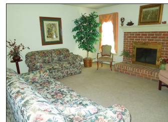
18' X 20' FAMILY ROOM