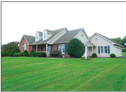
3.2-ACRES! CUSTOM HOME W/2-CAR GARAGE