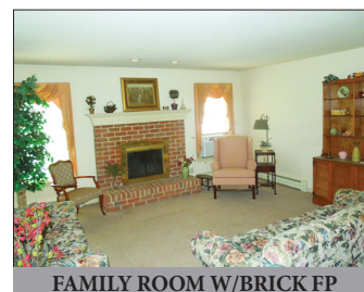
FAMILY ROOM W/BRICK FP