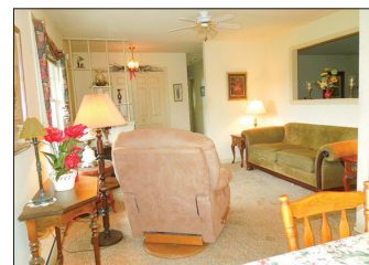
SITTING RM W/BAY WINDOW

For photos & listing visit www.martinandrutt.com