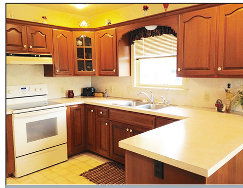
RAISED PANEL CUSTOM CHERRY KITCHEN

Located at 1725 Ligalaw Rd. East Earl, Pa. East Earl Twp. Lancaster Co.