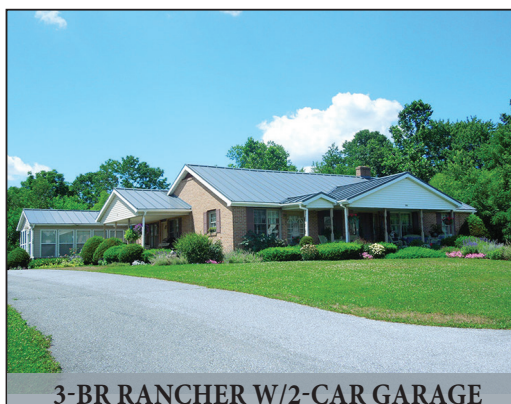
3-BR RANCHER W/2-CAR GARAGE