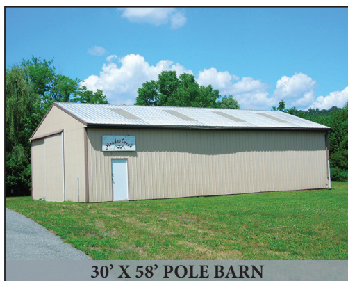
30' X 58' POLE BARN