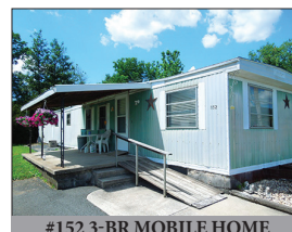
#152 3-BR MOBILE HOME