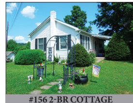
#156 2-BR COTTAGE