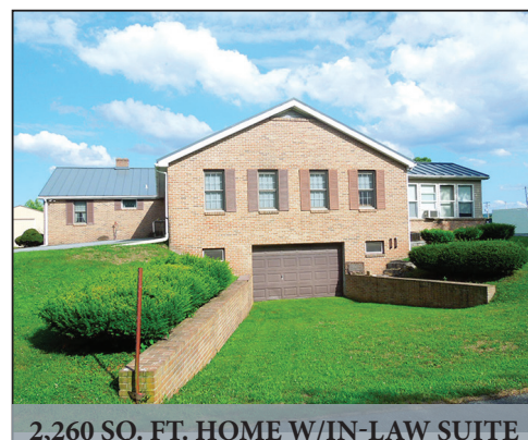
2,260 SQ. FT. HOME W/IN-LAW SUITE

Located at 152-164 W. Maple Grove Rd. (Bowmansville) Denver, Pa. Brecknock Twp. ELANCO schools.