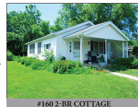
#160 2-BR COTTAGE

For photos & listing visit www.martinandrutt.com