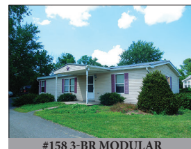
#158 3-BR MODULAR