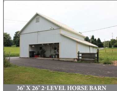
36' X 26' 2-LEVEL HORSE BARN