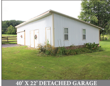
40' X 22' DETACHED GARAGE