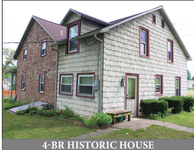
4-BR HISTORIC HOUSE