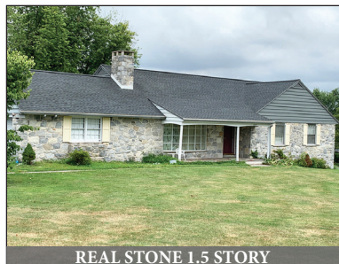
REAL STONE 1.5 STORY

2.6 ACRES * REAL STONE 1.5-STORY HOUSE * NICE ATTACHED GARAGE * 4 BR's & 3 BATHS * VACANT LOT ANTIQUES * PERSONAL PROP. * MAJOLICA COLLECTION SATURDAY, SEPTEMBER 26, 2020 @ 9:00 AM * R.E @ NOON