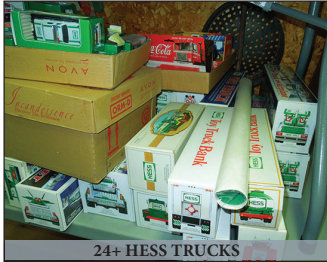
24+ HESS TRUCKS

3-BDRM 1.5 BATH 2-STORY HOME w/2-CAR GARAGE * .80-AC. LOT DETACHED GARAGE/SHOP * 20'x32' IN-GROUND POOL * UTILITY SHED JD MOWER * TOOLS * ANTIQUES * GLASSWARE * 1962 PONTIAC COUPE SATURDAY, SEPTEMBER 19, 2020 @ 8:30 AM/Real Estate @ 2-PM