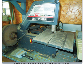
10" CRAFTSMAN BAND SAW