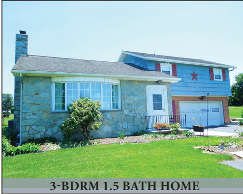
3-BDRM 1.5 BATH HOME

3-BDRM 1.5 BATH 2-STORY HOME w/2-CAR GARAGE * .80-AC. LOT DETACHED GARAGE/SHOP * 20'x32' IN-GROUND POOL * UTILITY SHED JD MOWER * TOOLS * ANTIQUES * GLASSWARE * 1962 PONTIAC COUPE SATURDAY, SEPTEMBER 19, 2020 @ 8:30 AM/Real Estate @ 2-PM