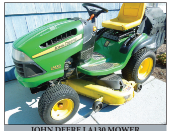
JOHN DEERE LA130 MOWER