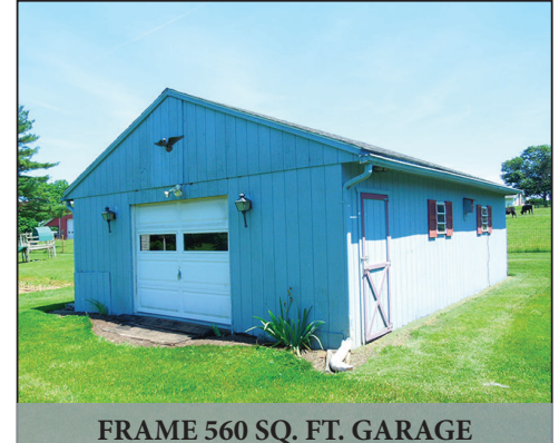
FRAME 560 SQ. FT. GARAGE

Located at 188 Wanner Rd. Ephrata, Pa. 17522 Earl Twp. Elanco Schools