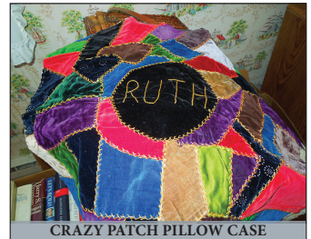
CRAZY PATCH PILLOW CASE