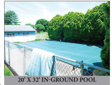
20' X 32' IN-GROUND POOL

REAL ESTATE: consists of a 1,424 sq. ft. 2-story 3-bdrm dwelling w/2-car garage, detached garage/shop, pool & utility shed. Main floor features a custom cherry cabinet kitchen w/appliances; formal dining room; living room w/HW floors & bay window; laundry w/W&D; powder rm; 2-car garage; upper level has 3-bdrms & full bath; unimproved partial basement w/heat pump/central AC; 200-amp svc; on-site well & septic; annual taxes: $3,200. Outbuildings: a 560 sq. ft. frame garage/shop w/electric; an 8x12 utility shed w/electric; a 20'x32' in-ground pool w/fence; large yard & garden area.