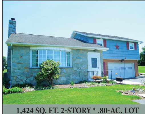
1,424 SQ. FT. 2-STORY * .80-AC. LOT