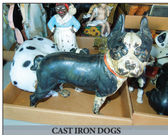
CAST IRON DOGS