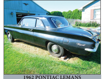
1962 PONTIAC LEMANS

For photos & listing visit www.martinandrutt.com