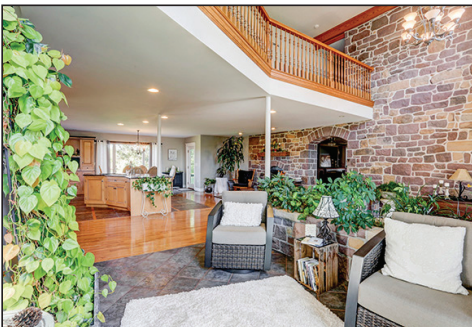
SIDE FOYER WALL