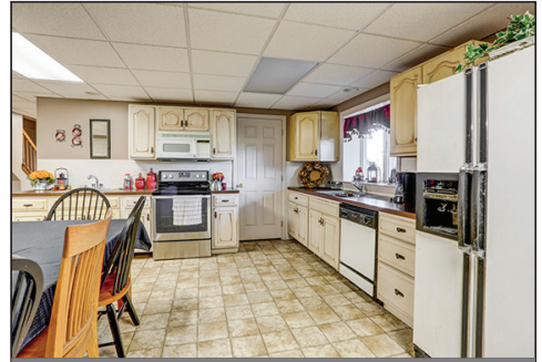
LOWER LEVEL KITCHEN