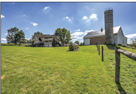
VIEW FROM SIDE YARD