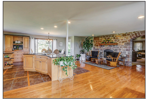
KITCHEN & SITTING AREA