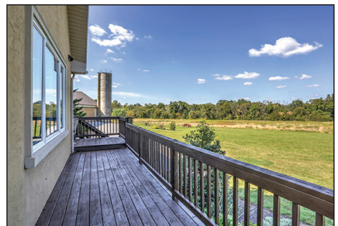
VIEW FROM DECK