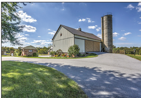
STORAGE IN BANK BARN