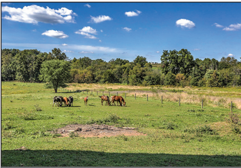
7+ ACRES OF PASTURE