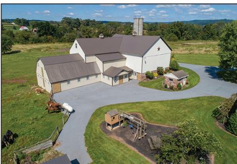
NEW STEEL ON BARN