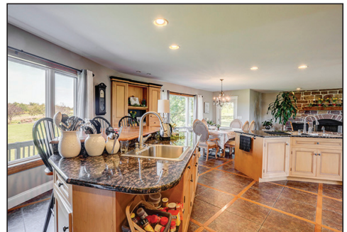
KITCHEN & SIDE WINDOWS