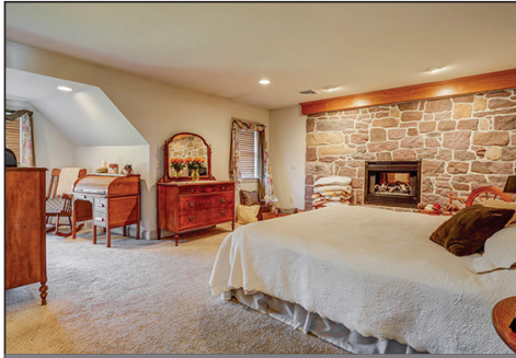
MASTER BEDROOM FIREPLACE