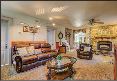
LIVING ROOM FIREPLACE