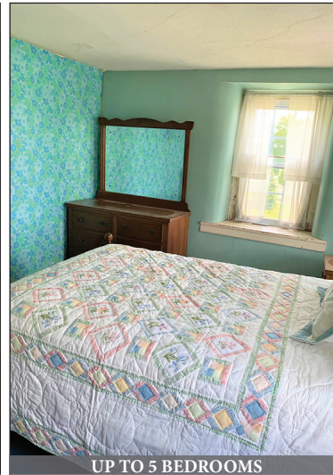
UP TO 5 BEDROOMS