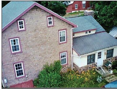
SHOWS REAR ADDITION