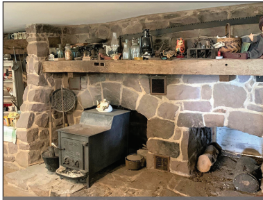
STONE FIREPLACE IN KITCHEN

2.2 ACRES * LARGE 2-STORY SANDSTONE HOUSE * 5-BR CENTRAL A/C * OLDER FRAME BARN * GREAT LOCATION HONDA CRV * ANTIQUES * TRACTOR * FURNITURE SATURDAY AUG. 29, 2020 @ 9:00 AM * R.E. @ NOON