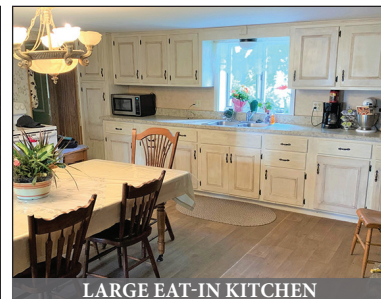
LARGE EAT-IN KITCHEN

Located at 870 Fivepointville Rd. Stevens Pa. 17578