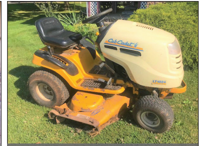
CUB CADET MOWER