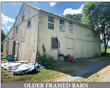
OLDER FRAMED BARN