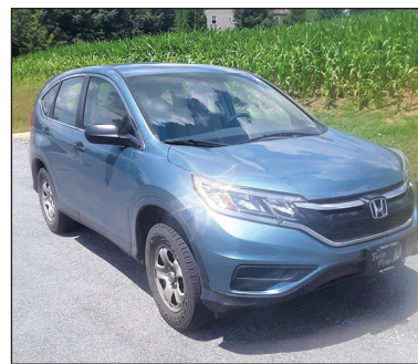
2015 HONDA CR-V