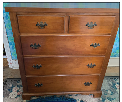
CHERRY BEDROOM SUITE