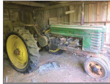
JOHN DEERE MODEL "H"