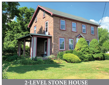
2-LEVEL STONE HOUSE

2.2 ACRES * LARGE 2-STORY SANDSTONE HOUSE * 5-BR CENTRAL A/C * OLDER FRAME BARN * GREAT LOCATION HONDA CRV * ANTIQUES * TRACTOR * FURNITURE SATURDAY AUG. 29, 2020 @ 9:00 AM * R.E. @ NOON