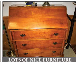
LOTS OF NICE FURNITURE

Located at 689 Fivepointville Rd. Denver Pa. 17517