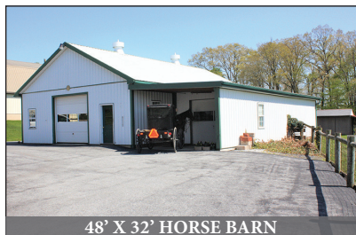
48' X 32' HORSE BARN