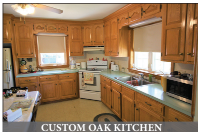
CUSTOM OAK KITCHEN