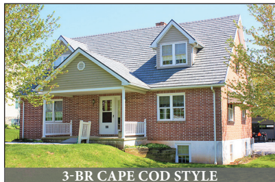
3-BR CAPE COD STYLE

1+ ACRE LOT * 3-BR CAPE COD * CLEAN 48'x 32' HORSE BARN * PASTURE * ANTIQUES PERSONAL PROPERTY * FURNITURE * COLLECTIBLE SATURDAY AUGUST 1, 2020 @ 9:00 AM * RE @ 1:00 PM