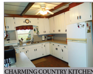
CHARMING COUNTRY KITCHEN

REAL ESTATE: consists of a 5-bdrm 2-bath 1.5 story dwelling & 3-bay 2-story garage on a rural 1-ac. +/- lot. Main floor features a foyer w/tile flooring & pine bookshelves; 12'x14' dining room w/HW laminate flooring; painted cabinetry kitchen w/glass-top range, fridge, Formica counter-tops, exposed rafters; full bath/laundry combo; 14'x18' family room w/cathedral ceiling open to upper loft, stone fireplace w/wood-burning insert; bedroom or office; 20'x20' living room w/woodstove, LP wall heat, pine wood walls, spiral stairs, patio doors to 26'x16' front brick paver patio; upper level includes an open loft; 4-bdrms & full bath; master w/cathedral ceiling & rustic exposed beams; unimproved partial basement; electric heat w/LP & woodstove aux. heat; on-site well & septic system; 500 gallon LP tank; annual taxes: $4,145. Outbuildings: an 8'x12' utility shed & a 1,140 sq. ft. 2-story 3-bay garage (2002) w/shop area; full bath w/LP heat; upper level 800 sq. ft. guest room w/kitchen; macadam driveway; fenced pasture; garden area; nice landscaping & mature shade.