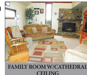
FAMILY ROOM W/CATHEDRAL CEILING

OPEN HOUSE: SAT. JUNE 13 & 20 from 1-3 PM for info call auctioneer @ (717) 371-3333.