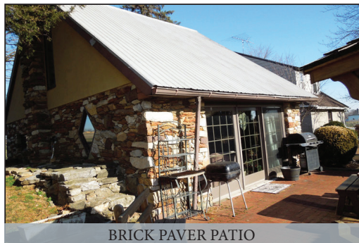
BRICK PAVER PATIO