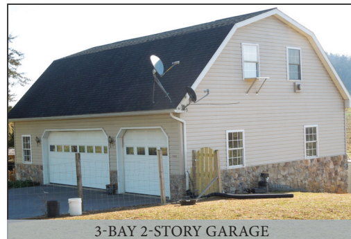
3-BAY 2-STORY GARAGE

Located at 180 Covered Bridge Rd. Ephrata, Pa. W. Earl Twp. Lancaster Co.