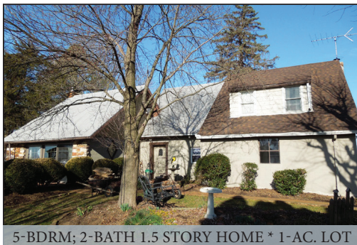
5-BDRM; 2-BATH 1.5 STORY HOME * 1-AC. LOT