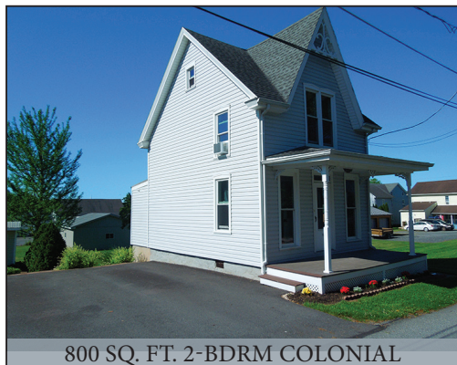
800 SQ. FT. 2-BDRM COLONIAL