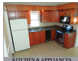
KITCHEN & APPLIANCES

BROKER PARTICIPATION INVITED call auctioneer to register (717) 371-3333 For photos & listing visit www.martinandrutt.com