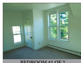
BEDROOM #1 OF 2