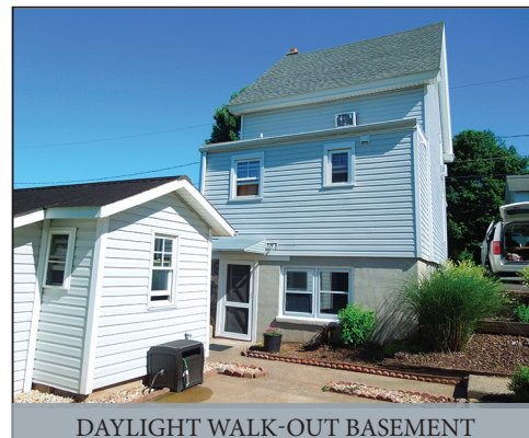
DAYLIGHT WALK-OUT BASEMENT

Located at 108 Church St. (Bowmansville) Narvon, Pa. Brecknock Twp. Lancaster Co.