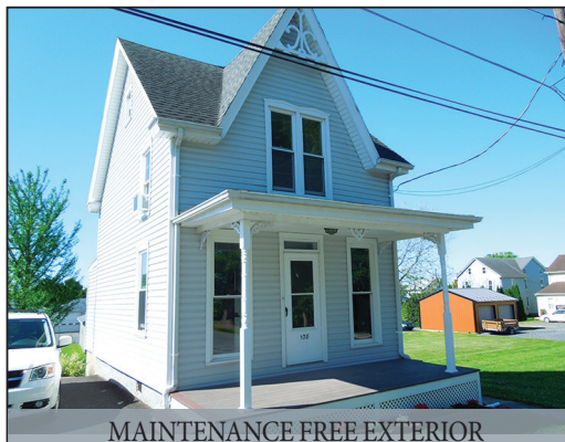
MAINTENANCE FREE EXTERIOR