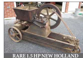
RARE 1.5 HP NEW HOLLAND