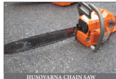
HUSQVARNA CHAIN SAW

CAR/TOOLS/GARAGE ITEMS LISTING: 2007 Buick Lucerne, CXL, Silver color, leather interior, 49,000 miles, 3800 V-6, garage kept, new inspection (very nice); 2000 Chevy pick-up, 4x4, 3/4 ton, dark Blue, regular cab, long bed, automatic, 70,000 miles, garage kept, (nice); very rare New Holland Hit-Miss engine, 1.5 HP, Serial #78 (second oldest known in this size), high base, round rod, on 3 wheel cart, (nice original); hole post jig attachment for hit-miss engines (original); Gravely ZT-48HD zero-turn mower w/ 24 HP, 48" cut, grass catcher, 338 hrs; Beco 3500 psi washer (like new); MF-305 snow blower; Husqvarna #51 18" chain saw; Stihl 009-L 13" chain saw; Troy-Bult roto-tiller (Horse); Mighty Mac 6.5 HP wood chipper; Honda HR-215 lawn mower; 3.5 HP lawn edger; old 2 HP reel mower; Log Buster log splitter; Echo weed trimmer; Homelite leaf blower/vac; polywood lawn cart (like new); wagons w/ air tires; Alum multi-fuc. ladder; misc. wooden ladders; winch; bottle jacks; dirt tamper; Alum shovel; nice hand tools; cooler; tools in tool box; 10 gal. air compressor; newer shop vac; 20" iron school bell (nice); ropes & chains; old hay hooks & tracking; old water trough; (3) milk cans; unusual kerosene can; (3) have-a-heart traps; volleyball poles; Brass Quoits; pole saws; iron feed trough; galv. buckets & water cans; wet stone; firewood rack; old bikes; porch swing; plus much more unlisted; please bring your lawn chair, auction under tent.