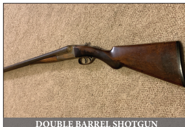
DOUBLE BARREL SHOTGUN