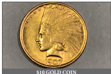
$10 GOLD COIN

2.5 STORY ALL BRICK HOUSE * LEVEL .72 ACRE LOT 5 CAR GARAGE * 4 BEDROOMS * VERY CLEAN PERSONAL PROPERTY * N.H. HIT-MISS ENGINE * CAR SATURDAY, JULY 18, 2020 @ 9:00 AM * R.E. @ 1:00 PM