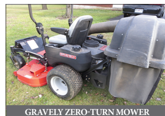
GRAVELY ZERO-TURN MOWER

CAR/TOOLS/GARAGE ITEMS LISTING: 2007 Buick Lucerne, CXL, Silver color, leather interior, 49,000 miles, 3800 V-6, garage kept, new inspection (very nice); 2000 Chevy pick-up, 4x4, 3/4 ton, dark Blue, regular cab, long bed, automatic, 70,000 miles, garage kept, (nice); very rare New Holland Hit-Miss engine, 1.5 HP, Serial #78 (second oldest known in this size), high base, round rod, on 3 wheel cart, (nice original); hole post jig attachment for hit-miss engines (original); Gravely ZT-48HD zero-turn mower w/ 24 HP, 48" cut, grass catcher, 338 hrs; Beco 3500 psi washer (like new); MF-305 snow blower; Husqvarna #51 18" chain saw; Stihl 009-L 13" chain saw; Troy-Bult roto-tiller (Horse); Mighty Mac 6.5 HP wood chipper; Honda HR-215 lawn mower; 3.5 HP lawn edger; old 2 HP reel mower; Log Buster log splitter; Echo weed trimmer; Homelite leaf blower/vac; polywood lawn cart (like new); wagons w/ air tires; Alum multi-fuc. ladder; misc. wooden ladders; winch; bottle jacks; dirt tamper; Alum shovel; nice hand tools; cooler; tools in tool box; 10 gal. air compressor; newer shop vac; 20" iron school bell (nice); ropes & chains; old hay hooks & tracking; old water trough; (3) milk cans; unusual kerosene can; (3) have-a-heart traps; volleyball poles; Brass Quoits; pole saws; iron feed trough; galv. buckets & water cans; wet stone; firewood rack; old bikes; porch swing; plus much more unlisted; please bring your lawn chair, auction under tent.