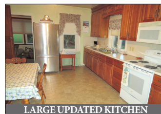
LARGE UPDATED KITCHEN

Please visit our updated website at www.martinandrutt.com