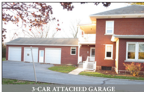
3-CAR ATTACHED GARAGE