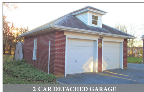
2-CAR DETACHED GARAGE

Located at 30 W. Mohler Church Rd. Ephrata Pa. 17522