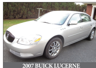
2007 BUICK LUCERNE