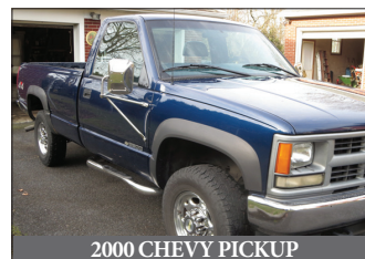
2000 CHEVY PICKUP