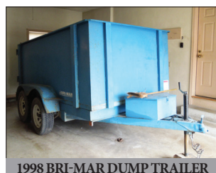
1998 BRI-MAR DUMP TRAILER