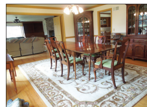
CHERRY DINING ROOM SUITE