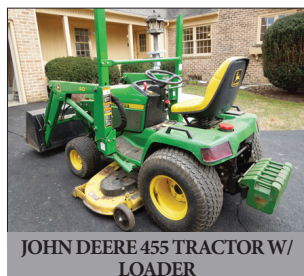
JOHN DEERE 455 TRACTOR W/ LOADER

Terms: Cash, PA check or credit card w/3% admin fee. Food stand provided; announcements day of sale take precedence over prior ads.