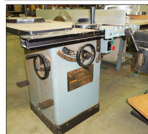
DELTA 10" ARBOR SAW