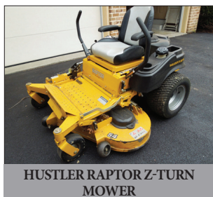
HUSTLER RAPTOR Z-TURN MOWER