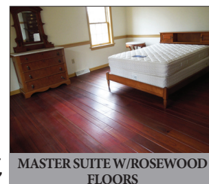
MASTER SUITE W/ROSEWOOD FLOORS