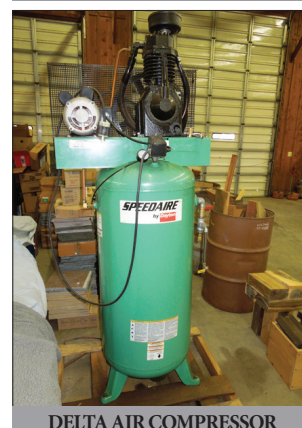
DELTA AIR COMPRESSOR