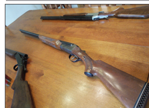
RIFLES & SHOTGUNS