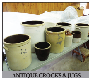
ANTIQUÉ CROCKS & JUGS