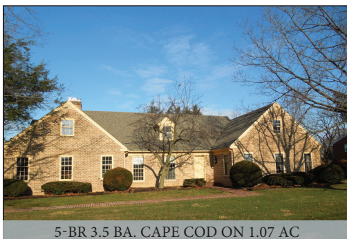
5-BR 3.5 BA. CAPE COD ON 1.07 AC