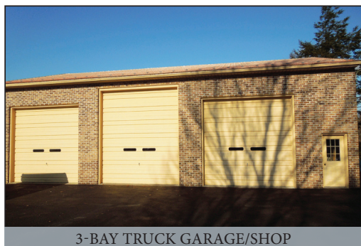
3-BAY TRUCK GARAGE/SHOP

5-BDRM 3.5 BATH CUSTOM BRICK CAPE COD * 1.07 AC. LOT ATTACHED 2-CAR GARAGE * 3-BAY BRICK TRUCK GARAGE/SHOP JD 455 TRACTOR * HUSTLER MOWER * BRI-MAR TRAILER * GUNS WOODWORKING EQUIP * TOOLS * FURNITURE * ANTIQUES * ETC. SATURDAY, MAY 30, 2020 @ 9-AM/Real Estate @ 1:30-PM