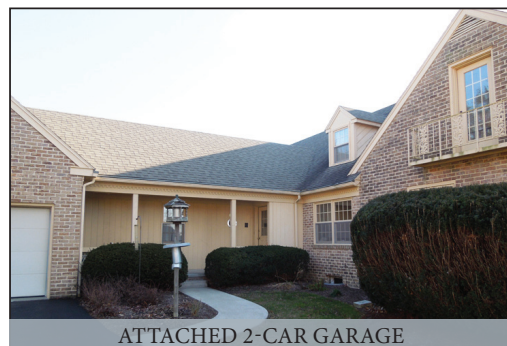
ATTACHED 2-CAR GARAGE

Located at 578 W. Sun Hill Rd. Manheim, Pa. Penn Twp. Lancaster Co.