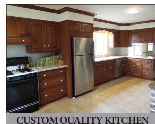
CUSTOM QUALITY KITCHEN

For photos & listing visit www.martinandrutt.com