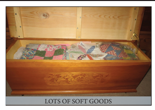
Located at 247 Bridgeville Rd. East Earl Pa. 17519