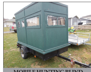
MOBILE HUNTING BLIND