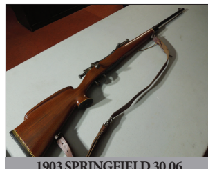
1903 SPRINGFIELD 30.06