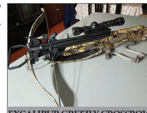
EXCALIBUR GRIZZLY CROSSBOW