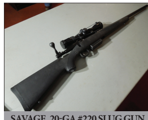
SAVAGE .20-GA #220 SLUG GUN