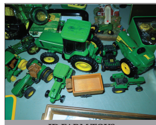
JD FARM TOYS