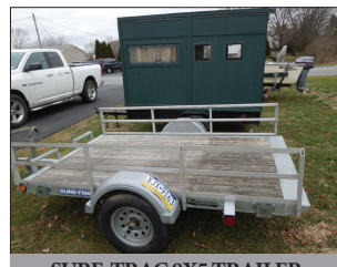
SURE-TRAC 5X8 TRAILER