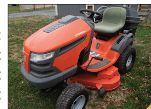
HUSQVARNA 22HP TRACTOR