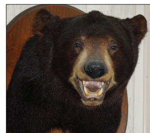
BLACK BEAR MOUNT