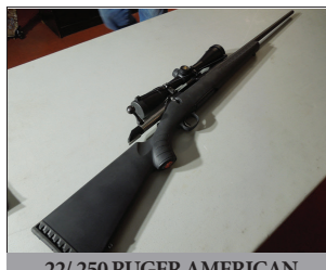
.22/.250 RUGER AMERICAN