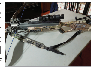
EXCALIBUR MATRIX CROSSBOW