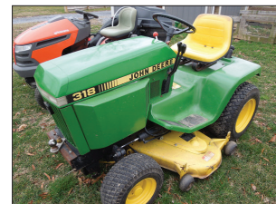
JOHN DEERE 318 TRACTOR