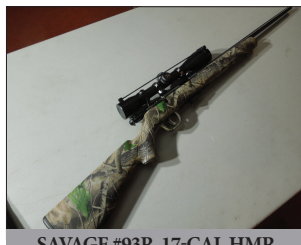
SAVAGE #93R .17-CAL.HMR