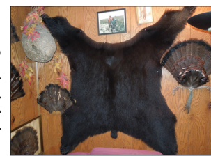
BLACK BEAR SKIN