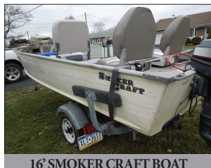
16' SMOKER CRAFT BOAT

For photos & listing visit www.martinandrutt.com