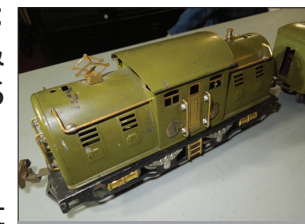
ANTIQUE LIONEL TRAIN SET