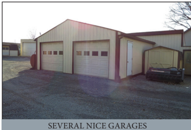
SEVERAL NICE GARAGES