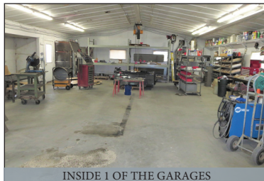
INSIDE 1 OF THE GARAGES