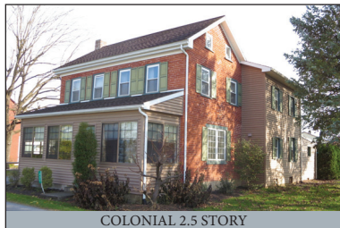
COLONIAL 2.5 STORY