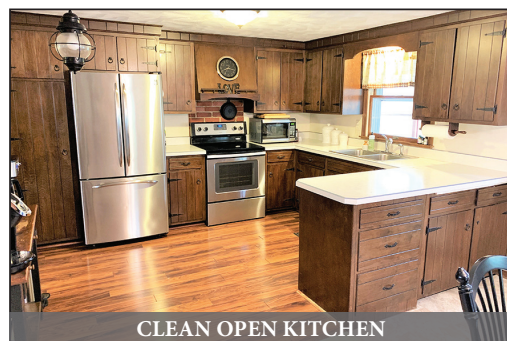
CLEAN OPEN KITCHEN

Located at 2303 Laurel Top Circle, Narvon Pa. 17555