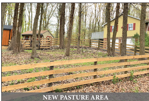
NEW PASTURE AREA