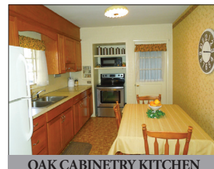
OAK CABINETRY KITCHEN

For photos & listing visit www.martinandrutt.com