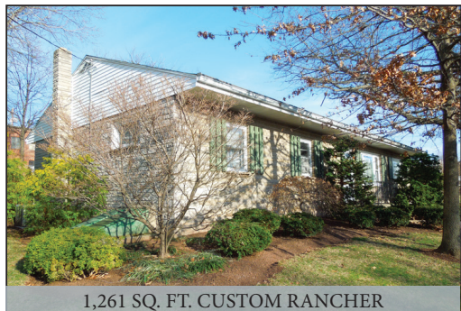
1,261 SQ. FT. CUSTOM RANCHER