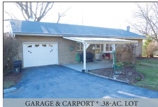
GARAGE & CARPORT * .38-AC. LOT

Located at 17 Landis Rd. Ephrata, Pa. Ephrata Borough, Lancaster Co.