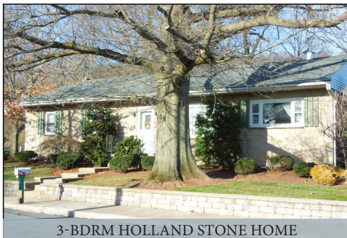
3-BDRM HOLLAND STONE HOME