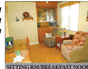
SITTING RM/BREAKFAST NOOK