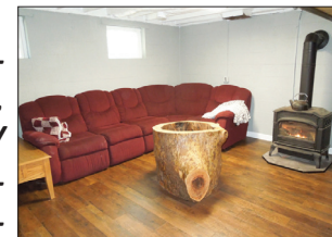
FAMILY RM W/LP STOVE