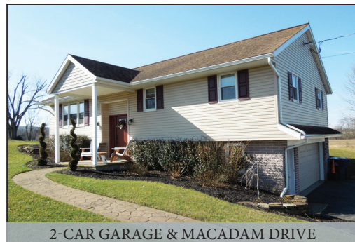
2-CAR GARAGE & MACADAM DRIVE

Located at 180 Fettersville Rd. East Earl, Pa. East Earl Twp. Lancaster Co.