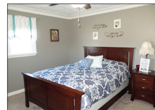
1 OF 3 BEDROOMS