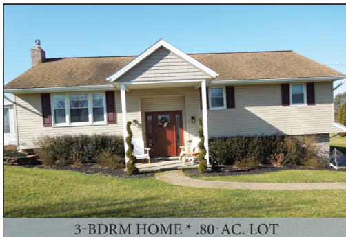
3-BDRM HOME * .80-AC. LOT