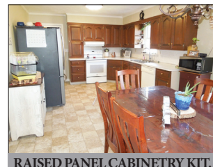
RAISED PANEL CABINETRY KIT.

For photos & listing visit www.martinandrutt.com