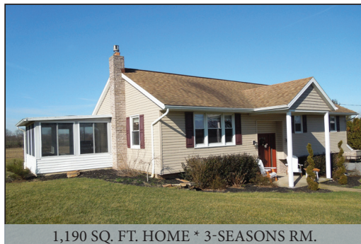
1,190 SQ. FT. HOME * 3-SEASONS RM.