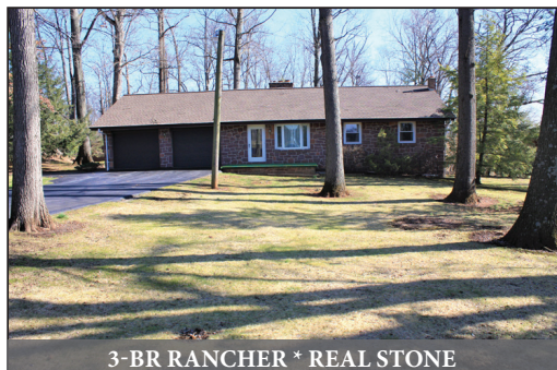
3-BR RANCHER * REAL STONE

3-BR STONE RANCHER IN THE COUNTRY * .68 ACRE ATTACHED 2-CAR GARAGE * GREAT LOCATION LEXUS CAR * TOYS * ANTIQUES * PERSONAL PROPERTY SATURDAY, MAY 2, 2020 @ 8:30 AM * RE @ 1:00 PM