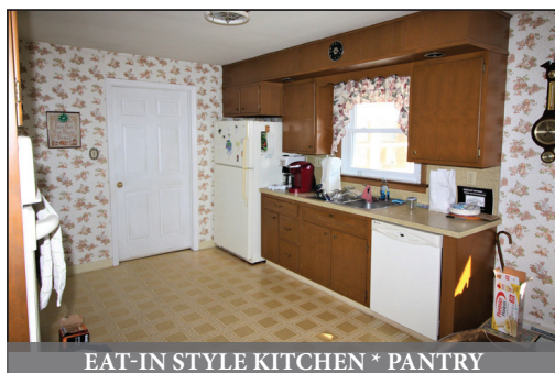
EAT-IN STYLE KITCHEN * PANTRY