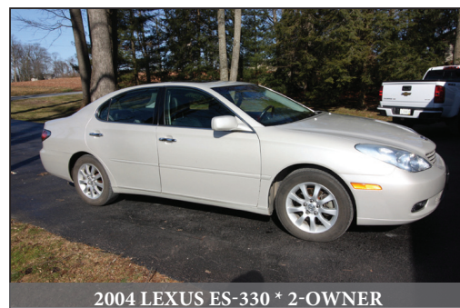
2004 LEXUS ES-330 * 2-OWNER

Located at 1134 E. Pieffer Hill Rd. Stevens Pa. 17578